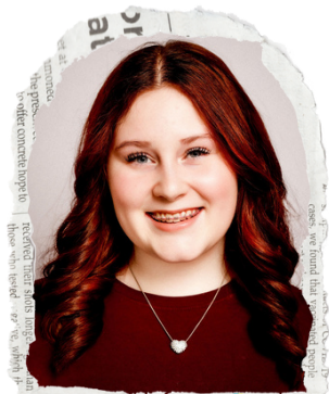
EDAX ESSE SE