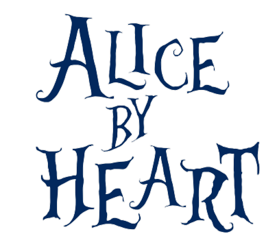
May 16 - 18, 2025